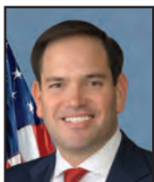
U.S. Senator Marco Rubio