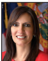
Lt. Governor Jeanette Nuñez