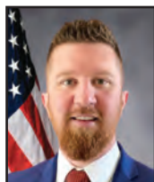
U.S. Rep. CD-9 Scotty Moore