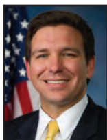
Governor Ron DeSantis