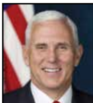
Vice-President Michael R Pence