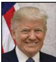
President Donald J Trump